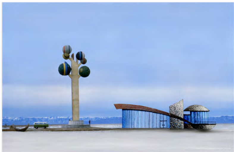
"Tree of Utah Museum" by Momen opening Spring 2021

"This survey exhibition brings together some of Karl Momen's most iconic works of the last four decades.